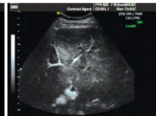
Liver vessels in Contrast Agent Imaging