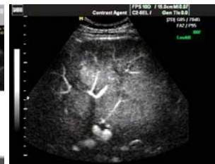
Liver vessels in Contrast Agent Imaging