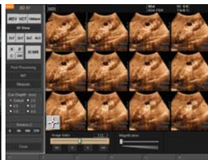
Renal cyst in Multi-Slice View