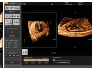
Fetal heart in Oblique View