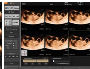
Fetal brain abnormal in Multi-Slice View