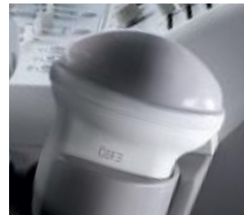
C6F3 fourSight transducer with 2D, 3D and 4D capabilities

The G60 S and G50 systems provide the superb productivity tools of the DIMAQ-IP integrated workstation, for rapid and efficient digital case management including cost-effective output to CD. And both systems meet your minute-by-minute needs for workflow efficiency, throughput and return on investment.